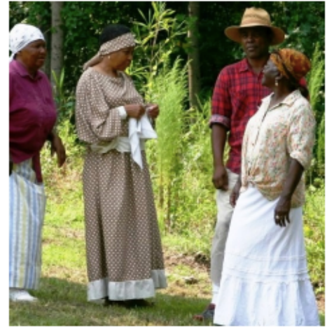
A historic re-enactor with Sandhills Sankofa Players