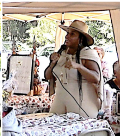
Mayor Kia Anthony