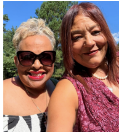
Guests from Richmond & Manassas, VA; Detroit, MI; Columbus, OH; Seale, AL; Los Angeles, CA; Springfield, MA; and across the State of NC